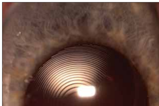
Figure 2. The IDIFF has up to 32 diffractive steps on the front optical surface.

Multifocal IOLs. These lenses are increasingly popular. Patients tend to understand the difference between mono- and multifocal lenses and correlate the latter with less need